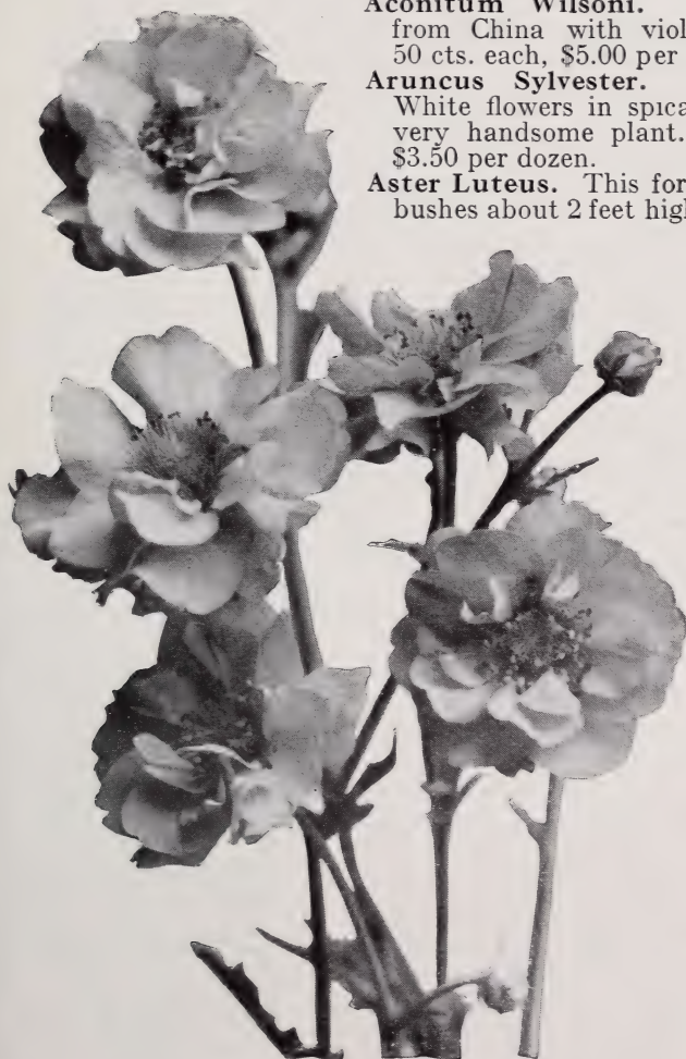
Geum "Orange Queen"

A. Queen Mary Large flowered aster of compact growth and 2½ ft. high. Rich, glisten-